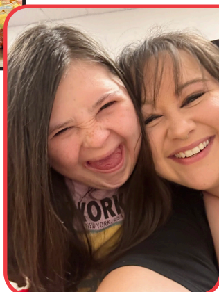
Building Abilities Summer Camp