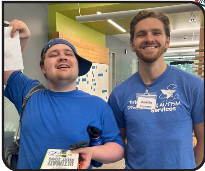
Building Abilities Day Program