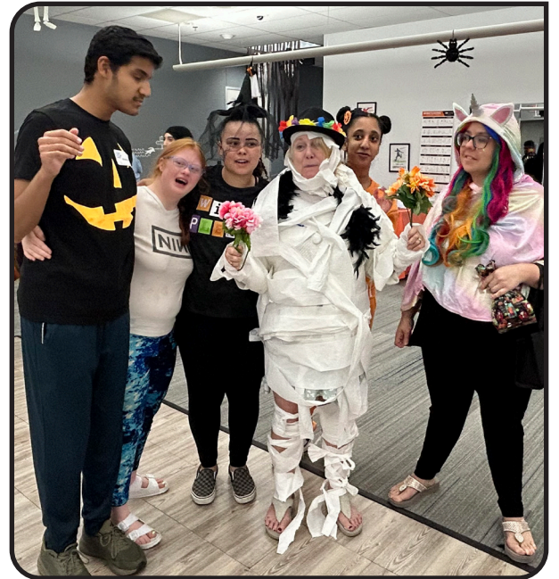
First Friday Fun Night