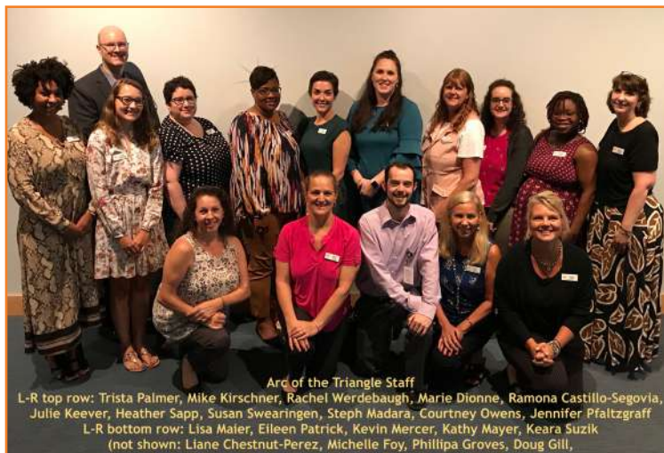
Arc of the Triangle Staff

As the pandemic weighed on us, HR focused on the well-being of all of our employees. As we slowly received information from various federal and state agencies, we looked for ways to help The Arc's employees. As our services